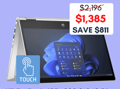
HP ProBook 435 x360 GIO 13.3"

AMD Ryzen 5 + 3yr Onsite ActiveCare 8GB RAM / 256GB Storage