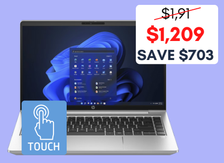
HP ProBook 440 GIO 14"

Intel i5 + 3yr Onsite ActiveCare I6GB RAM / 256GB Storage