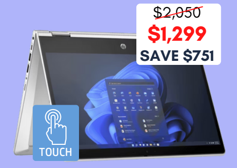
HP ProBook 435 x360 GIO 13.3"

AMD Ryzen 3 + 3yr Onsite Support 8GB RAM / 256GB Storage