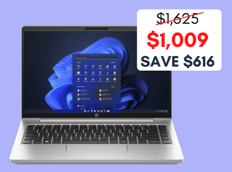
HP ProBook 445 GIO 14"

AMD Ryzen 5 + 3yr Onsite ActiveCare 8GB RAM / 256GB Storage