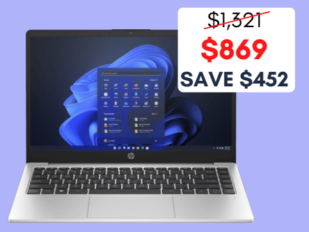
HP 245 GIO 14"

separately after 4 day wait period, please see back of flyer for more details Two options $39 for 1 claim over 3 years or $185 for 3 claims over 3 years