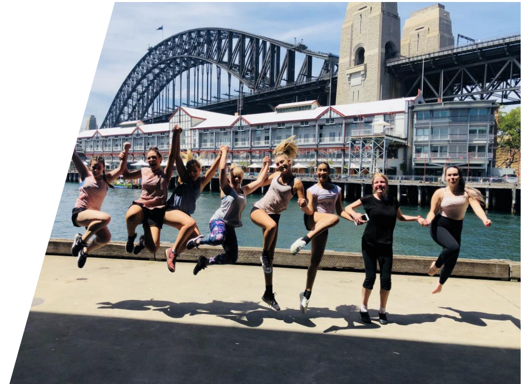
Sydney Dance Company Excursion - Year 12 2018